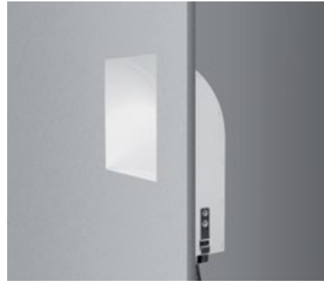
Recessed Plaster Trim