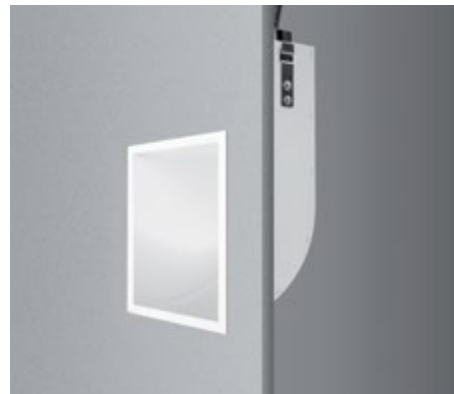
Recessed Bezel Trim