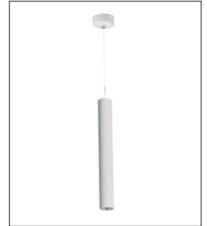
2.4" X 9.8" (7.5W)

General: Giotto is a family of compact, low profile LED downlights and pendants that provides a very defined and surprisingly wide beam in only 0.35" of aperture. An innovative solution called "Cross Optics Technology" uses two convex lenses facing each other. With one lens gathering all the light into one point and the other one opening the beam again, but without any secondary at this point, the result is a very defined and powerful lighting solution in the smallest body.