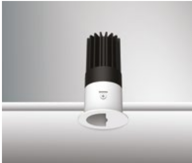
Recessed Bezel Trim (RBT)