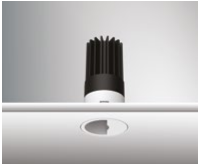
Recessed Plaster Trim (RPT)