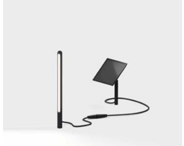
kal solar M